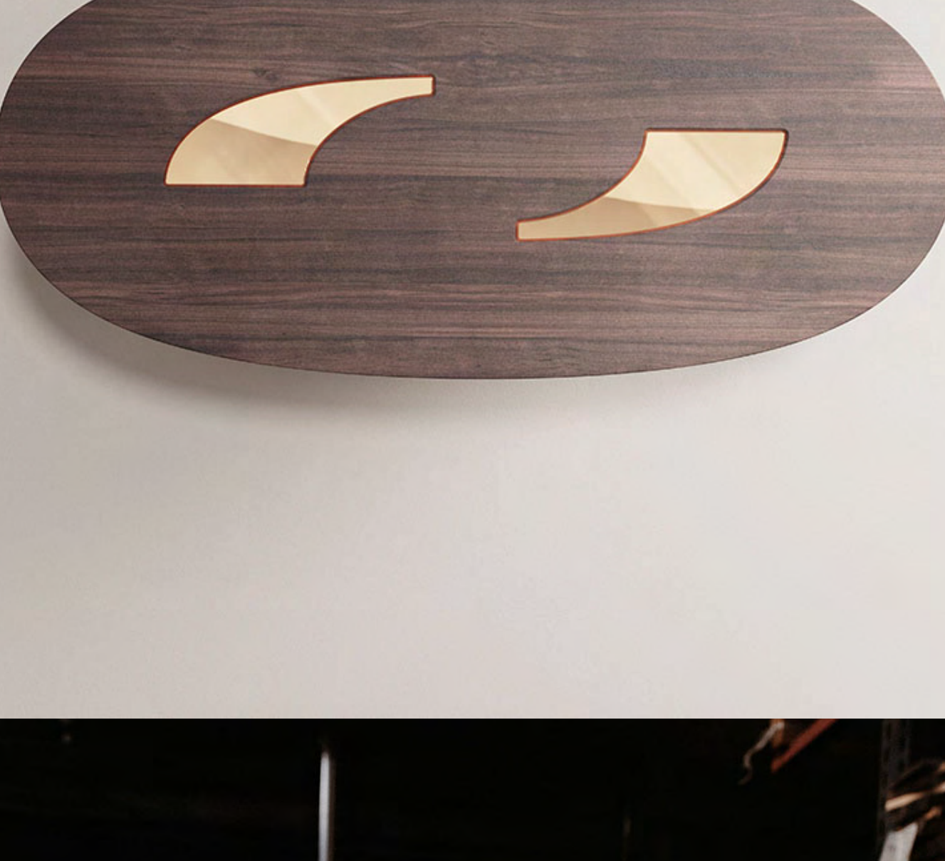
ETERNEL SANS TEMPS DINING TABLE OVAL - WALNUT + BRASS