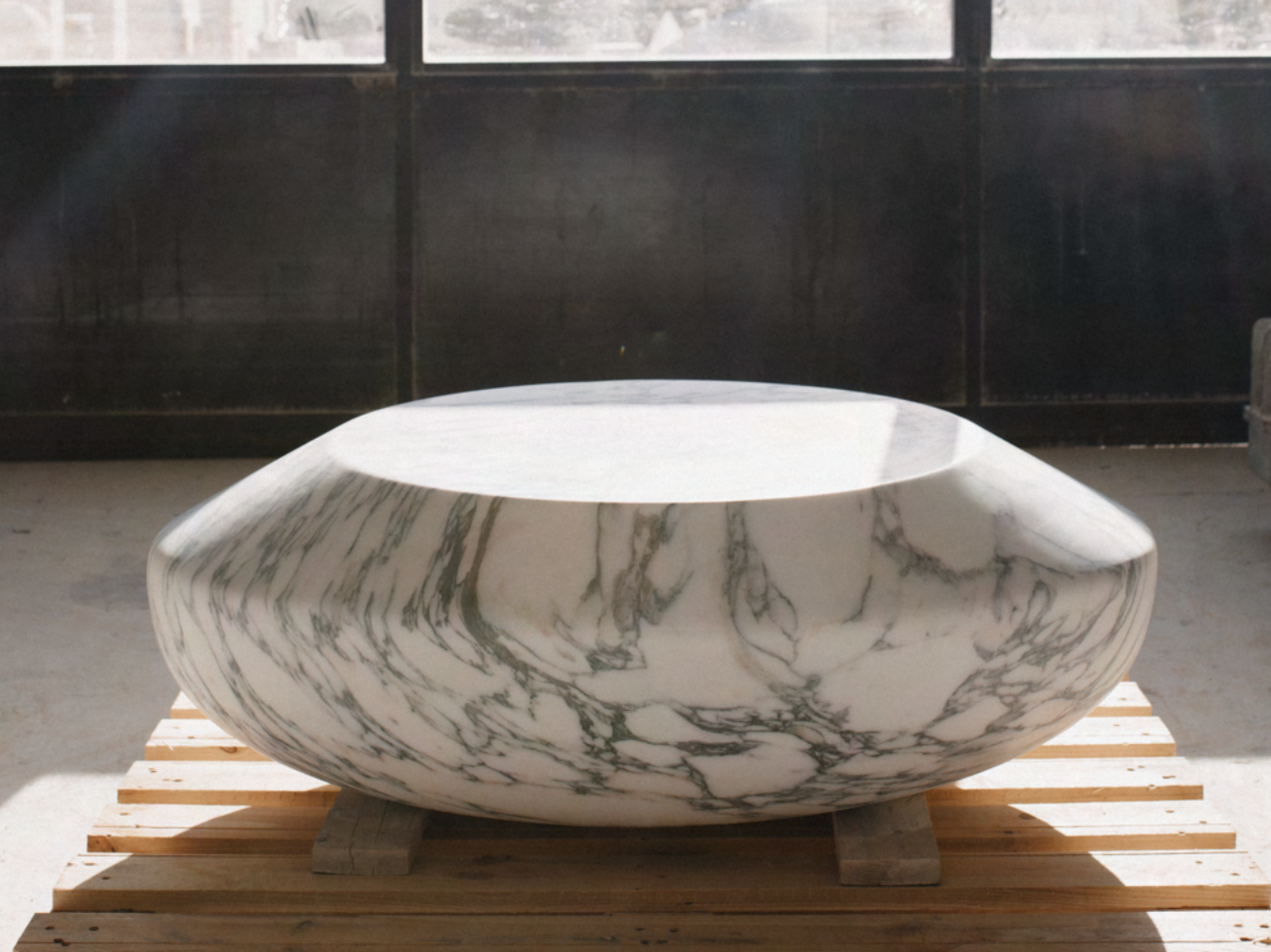
ETERNEL SANS TEMPS BENCH - GREY CARNICO MARBLE + STAINLESS STEEL